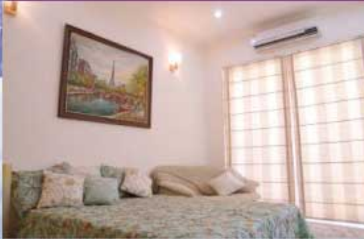
LUXURY OF SPACE