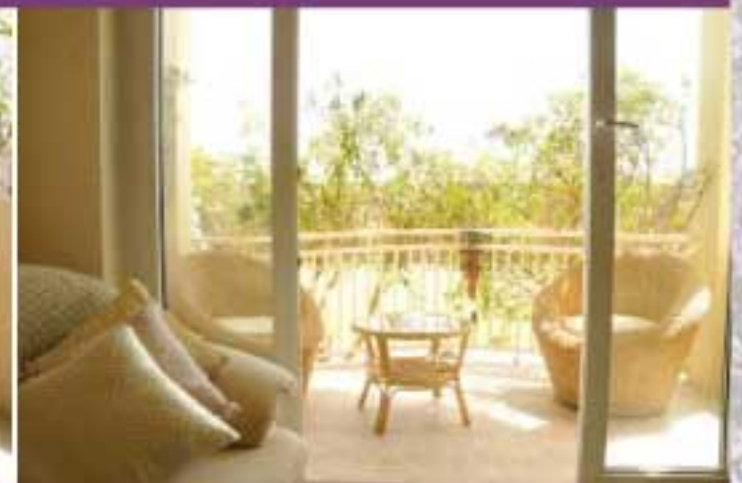
LUXURY OF NATURAL LIGHTS AND QUALITY AIR