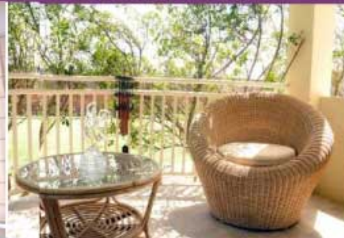
LUXURY OF OPENNESS